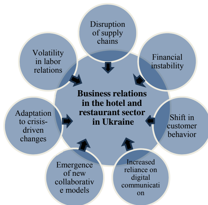
Fig. 1. The impact of the current socio-economic and crisis conditions on business relations in the hotel and restaurant sector in Ukraine

7. Emergence of new collaborative models. Crisis conditions have fostered increased collaboration between businesses, governments, and NGOs, particularly in efforts to provide humanitarian aid or services for displaced populations. These new forms of collaboration influence traditional business relations, focusing more on shared goals and community support (Fig. 1).