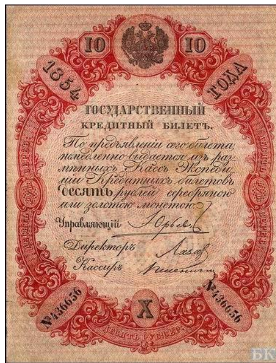
Fig.1 State banknote of 1854.

After the Crimean War the Russian Empire had quite an aggrieved financial system. It was limited by the European financial markets and therefore it was impossible to replenish the budget deficit by external borrowings to the full extent. There was a need in the additional emission of paper banknotes. With the budget of 300-400 million rubles only during 1855-1857 years there was issued almost half a billion banknotes 1 . On January 1, 1863 there were 698.9 million rubles in circulation (Fig.1).